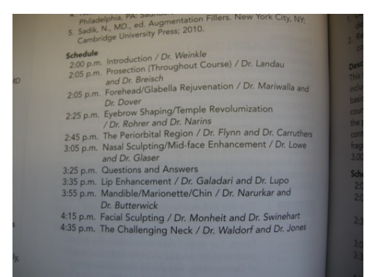
The Lecture Program